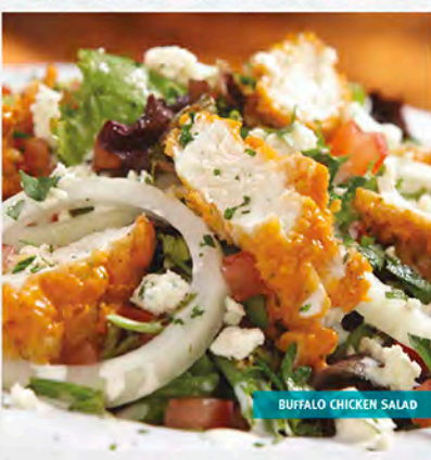
BUFFALO CHICKEN SALAD

SHRIMP & SPINACH SALAD Blackened shrimp served on a bed of spinach and topped with bleu cheese crumbles, diced tomatoes and fresh chopped bacon. Tossed in a balsamic vinaigrette dressing. 12.99