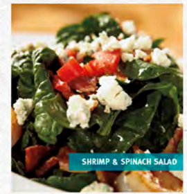
SHRIMP & SPINACH SALAD