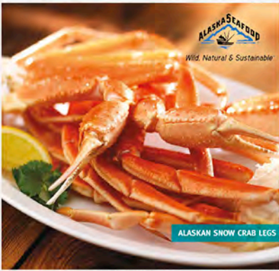
ALASKAN SNOW CRAB LEGS

ALASKAN SNOW CRAB LEGS Deadliest Catch™ approved! But seriously, you are about to bite into crab legs that are shipped to us from the frosty banks of Alaska and served up right with a side of butter. Makes you feel kinda fancy, doesn't it? 1LB 20.99