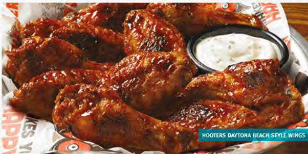
HOOTERS DAYTONA BEACH STYLE WINGS

Traditional style. No breading, but just as good. Order them with your favorite Hooters wing sauce.