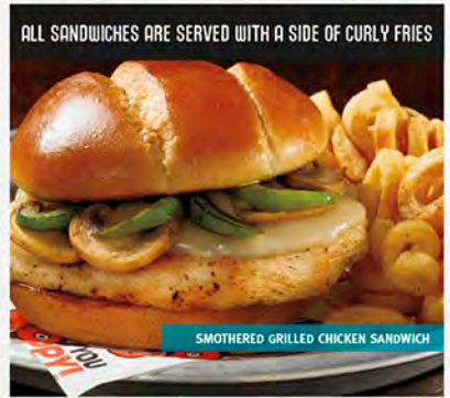
SMOTHERED GRILLED CHICKEN SANDWICH

GRILLED CHICKEN A juicy grilled chicken breast served with lettuce and tomato. 11.99 *Shown as smothered +1.00