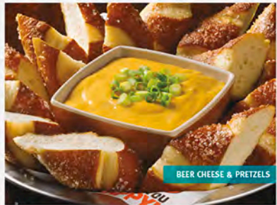
BEER CHEESE & PRETZELS