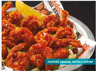
HOOTERS ORIGINAL BUFFALO SHRIMP